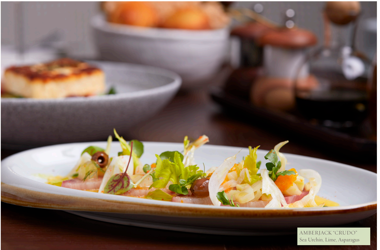
AMBERJACK "CRUDO" Sea Urchin, Lime, Asparagus

We believe in supporting local growers and producers, organically where possible, working together with our Partners in Provenance.